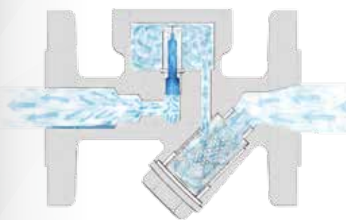
▲ The ECOFLOW innovative single piece casting

Once the condensate reaches the nozzle it begins to be ejected through the orifice by the steam. This is the point where the energy system (the steam) meets the waste system (the condensate). The enormous difference in condensate density (1000 times denser than steam) means the steam phase is effectively 'blocked' from entering the orifice.